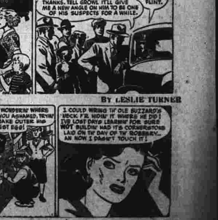
MOLLY HAS AN IDEA