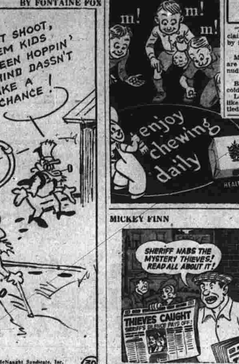
Sense and Nonsense