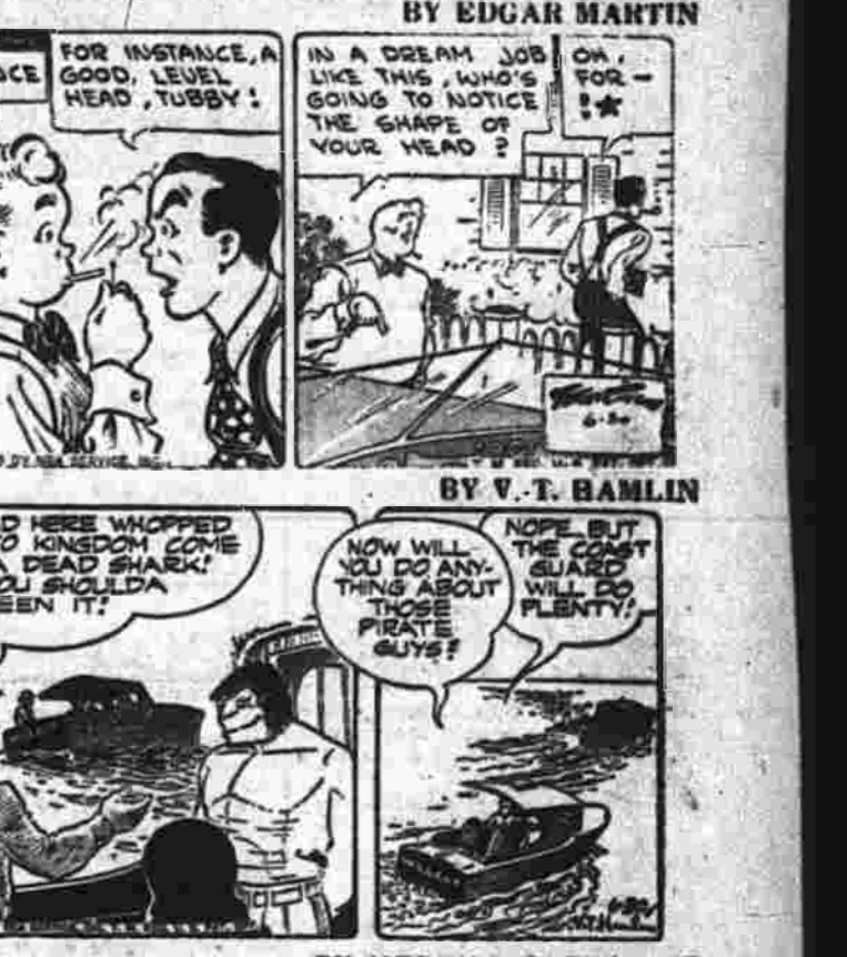
BOOTS AND HER BUDDIES